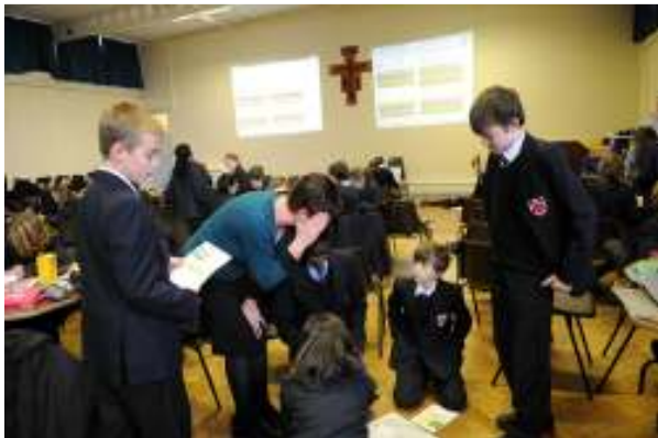
A shy Head of Year offers advice