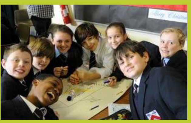
It was fun all the way at the high level board meetings.

Blue sky thinking was the order of the day.