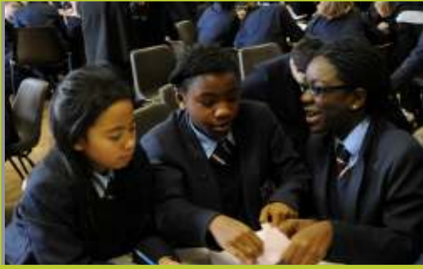
Students engaged in discussion about the best way to get their products on the shelves