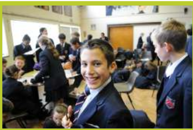
'This is great fun, I'm learning so much'. A Year 7 participant